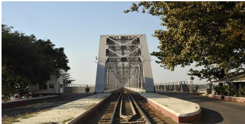
Old Ava road and rail bridge across the Irrawaddy River