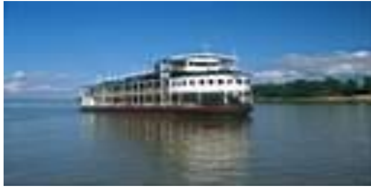
Paddle steamer on the Irrawaddy River

On arrival in Myanmar, you'd be invited to cruise the Ayeyarwady River from Mandalay downstream to Bagan. As the paddle steamer set sail, you'd take a last look back at enchanting Mandalay and take in the picturesque river scenery as it changes from cityscape to wide open countryside fields and gently rolling hills. To while away the time on board, have a drink at the outdoor Kipling's Bar or on the sun deck, as the boat sets sail towards Sagaing, one of the ancient capitals of Myanmar.