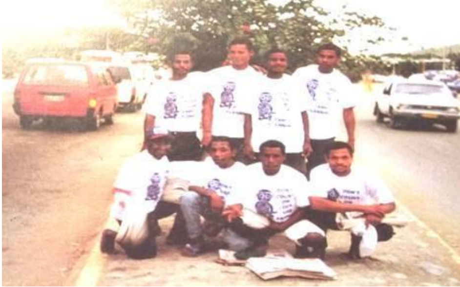
When the idea was working peacefully. The newspaper boys ready to do their bit in advertising World Population Day.

I was startled to receive a phone call about 10am asking me to come and bail him out, so off I went to Boroko Police station with our Security Officer in tow. I thought that perhaps I could swing the 'white missus' bit and have him excused. But when I got there, I was ushered into the boss's office and seated on a bench with the driver and a couple of other people. Before I could get in an appeal, the officer went into a tirade about how stupid the driver was and how come he worked for the UN and wasn't the UN the most wonderful organization here in PNG to help people.