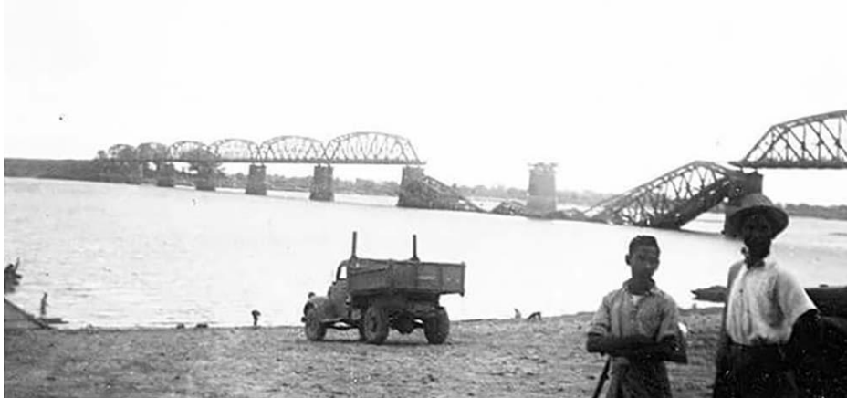
The Sagaing/Ava Bridge after it was dynamited by British troops

centre of the structure finally collapsed after being dynamited by British troops around 18 times in 1942. The spans linking Mandalay and Sagaing were then rebuilt by the original engineering group during 1954.