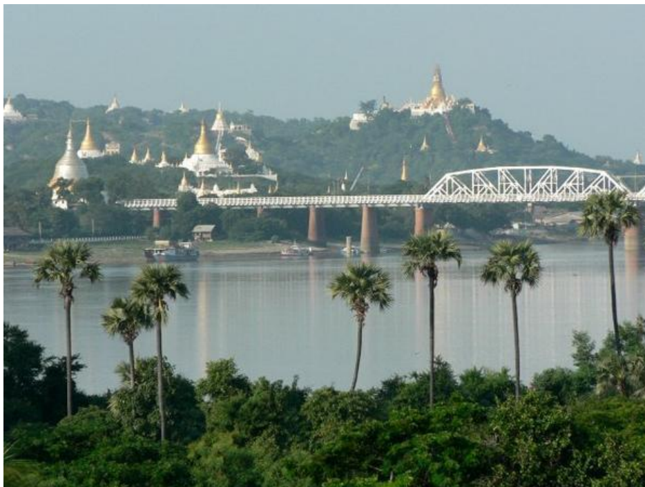
The Ava bridge at Sagain

When all had agreed, they made a start. Each brick was careful removed and cleaned, and villagers for miles around came to see the progress, and to help carry the bricks to the new site. Even small children joined in. As had been expected, they found in the centre a large cavity and in it were quite a number of silver tinsel images of the Buddha, and also a few brass ones. These were removed to a cash safe, but exhibited daily, and many people crowded round to see them. In great and solemn procession these were carried to the new Pagoda by the priests, and were built in, this time in good cement mortar. In due course, the new Pagoda was completed and the placing of the Tee on top was accompanied by music and festivities which lasted for three days and nights. When all was over, the priests came and presented him with a brass Buddha about 30cm high in recognition, as they said, of the care he had taken in the matter.