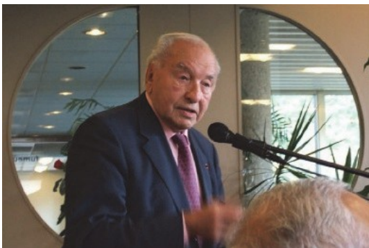
Mr. Blanchard Director-General ILO