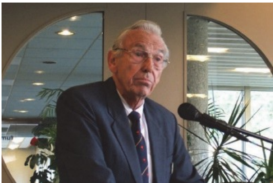
Dr. Mahler Director-General WHO