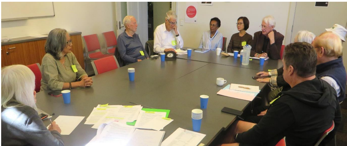
Members in discussion around the table.

* https://www.unjspf.org/wp-content/uploads/2026/02/Website-PDF-Report_December-2025-combined.pdf