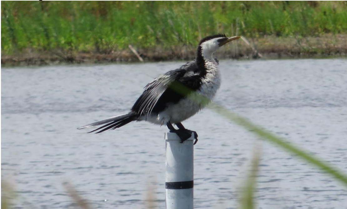
Pied Cormorant perched overlooking the lagoon. Distinguished from the slightly smaller Black-Faced Cormorant by wide white sides encompassing the eye and with a narrow black strip along the back of the neck. The other bird is black around the eye.

– in the complexity and inter-related nature of biological resilience and dependable food chains, for example, that enable a handful of bird species to cover the world with their incredible migration routes.