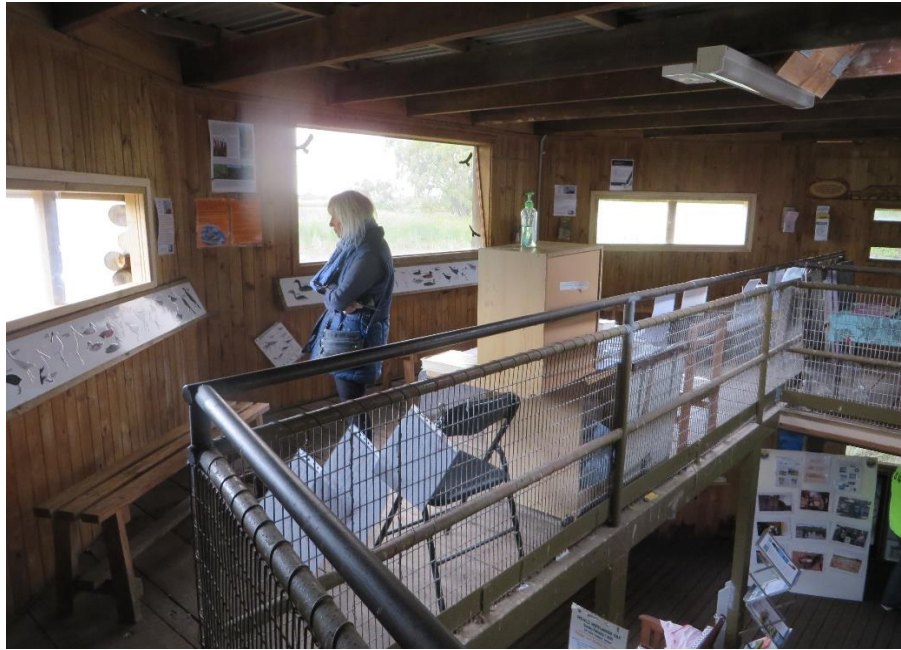
Upper deck of the Land for Wildlife Building opened by the Minister of Conservation in 1986. Windows look out over the lagoons of Edithvale South Wetlands, which were completely devoid of water and birds at the time of the visit.